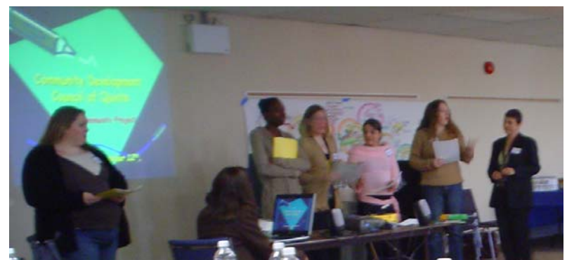
Quinte parents used a PowerPoint presentation to summarize demeaning public perceptions about families on low income that they anted to address in their community