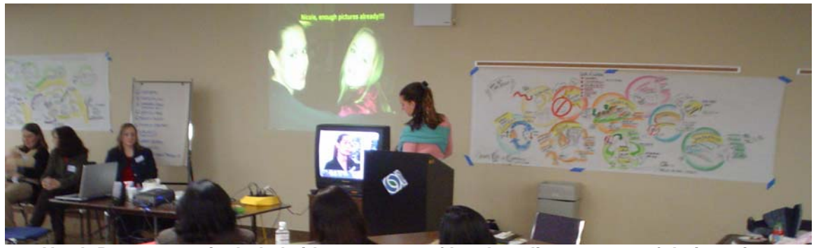
North Bay parents included video excerpts of local media coverage of their project

Parents and project staff from each local site made a presentation on their work to date.