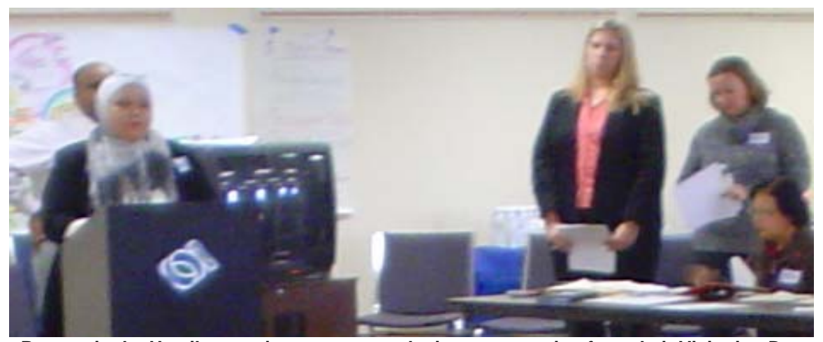
Parents in the Hamilton project present on the issues emerging from their Visioning Day